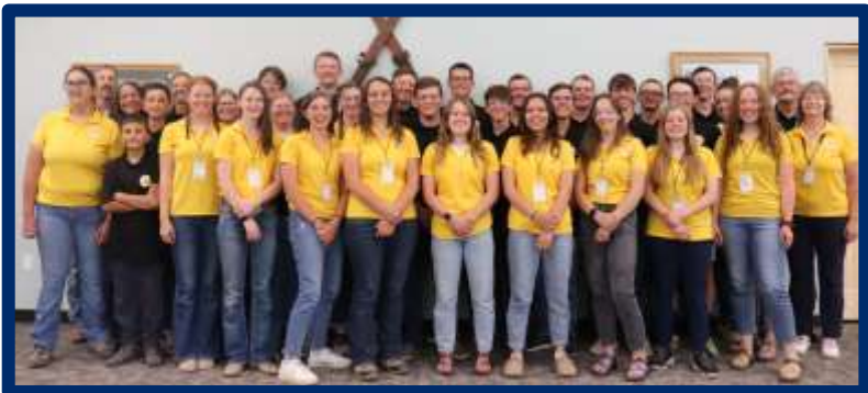
2024 Summer Staff